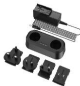
M Series Charging Base HM-5202ZC