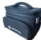
M/G/SP Series Pouch HM-SP01-POUCH

COMPLIANCE NOTICE: The thermal series products might be subject to export controls in various countries or regions, including without limitation, the United States, European Union, United Kingdom and/or other member countries of the Wassenaar Arrangement. Please consult your professional legal or compliance expert or local government authorities for any necessary export license requirements if you intend to transfer, export, re-export the thermal series products between different countries.