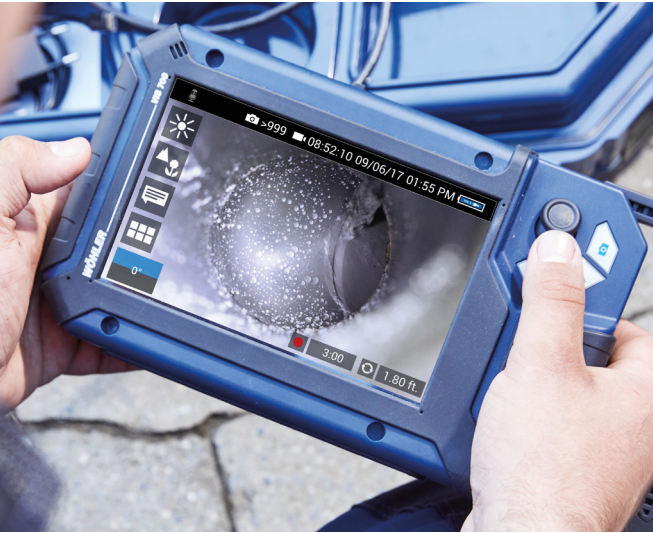
Sharp picture, clear menu and comfortable to hold.