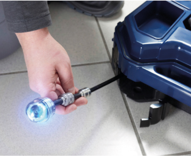
The 100 foot camera rod is flexible and durable because of its construction.