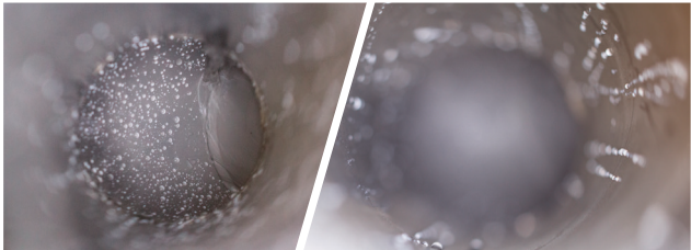
far range close range

The motor driven focus can be adjusted by touchscreen or joystick.