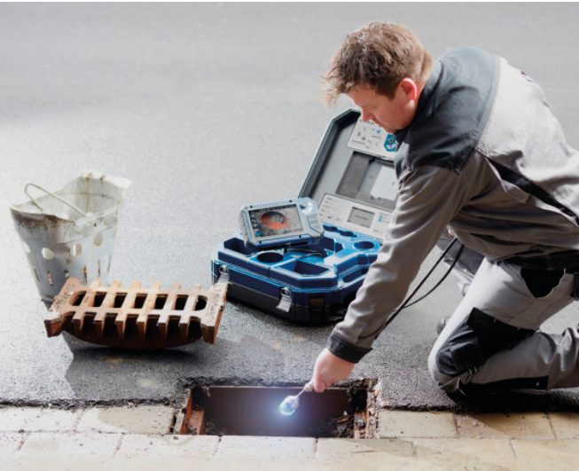
Secure drain inspection with the waterproof camera head.