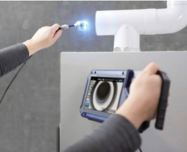
Inspection of flue gas lines from 2 inches, easily negotiates tight bends of 87°.