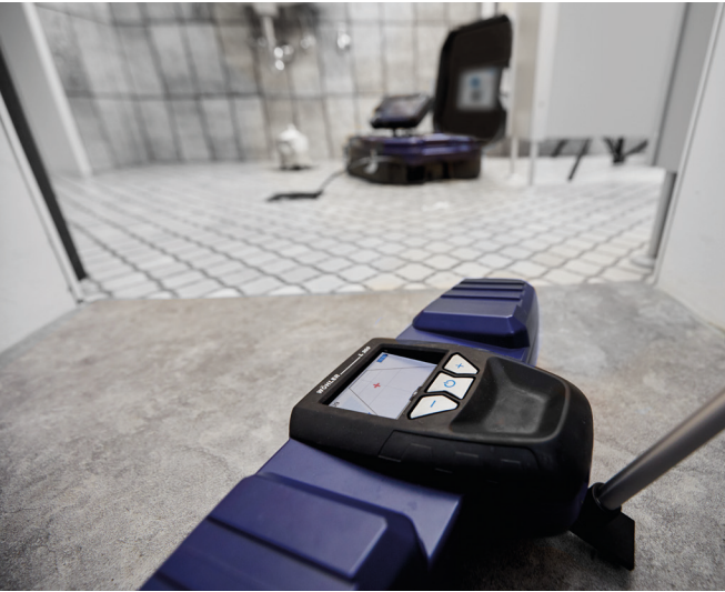
Precisely locate with the Wöhler L 200 Locator (~9 kHz).