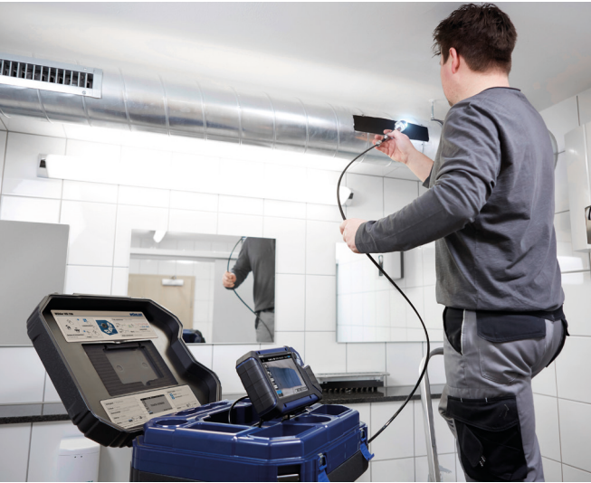
Easy inspection of ventilation systems with the 100 foot camera rod.